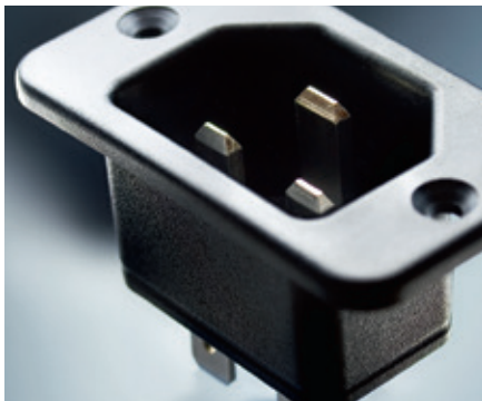
SCHURTER's 1681 IEC appliance inlet

Electric grills, heating devices, powerful projectors, data servers or lighting systems: these are all appliances that generate a high degree of heat during operation. Such appliances place special demands on the power supply. Inherent risks such as overheating, short circuits, burns or electric shocks must be reliably prevented for safe operation. Hot appliance inlets according to the IEC 60320-1 component standard guarantee this safety, as well as the compatibility of products from one manufacturer to the next.