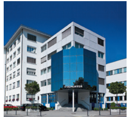
Headquarters in Lucerne

Explanations about the ranges and terms described here can be found on the SCHURTER website: schurter.com/gst . If you have any questions or suggestions to improve the information we provide, please contact us.