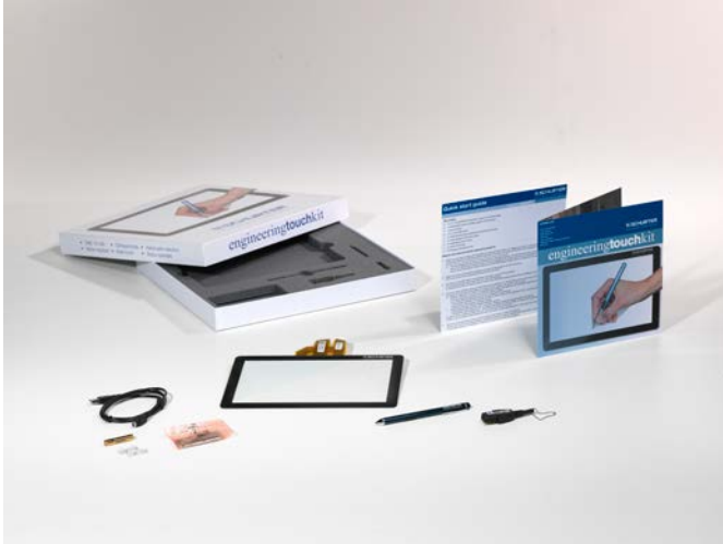
Contents of the Design-In-Kit